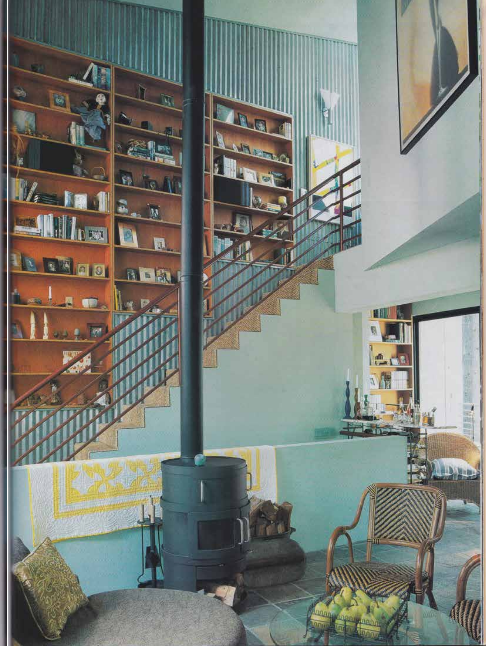
Corrugated steel walls (TOP) add light and texture to the living room. ABOVE LEFT: Pottery Barn chairs attend an 1870 Mexican dining table made of barn siding. ABOVE RIGHT: Although small, the tall kitchen with generous windows feels expansive. OPPOSITE: A double-height wall of shelves marches up the staircase to the master bedroom.